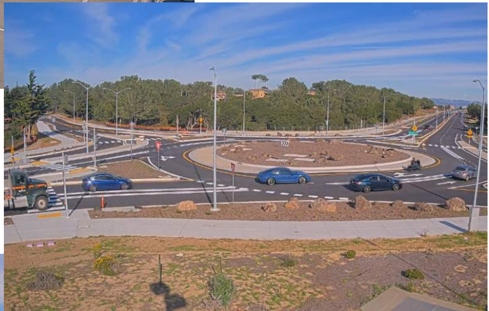
Imjin Parkway at Abrams Drive