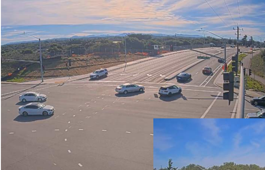
Imjin Parkway at Reservation Road