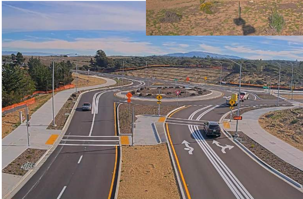
Imjin Parkway at Imjin Road